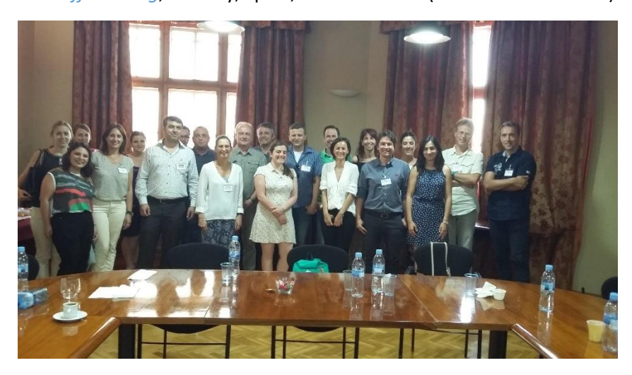
1<sup>st</sup> BIOSEA meeting, in El Puerto de Santa Maria, Spain, CTAQUA facilities (20-21<sup>st</sup> of February 2018)

Kick-off meeting, in Alcoy, Spain, AITEX facilities (21-22<sup>nd</sup> of June 2017)