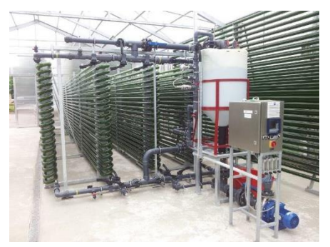
Microalgae cultivation system